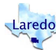
Table 5 – Low Priority Market Packages for the Laredo Region (continued)